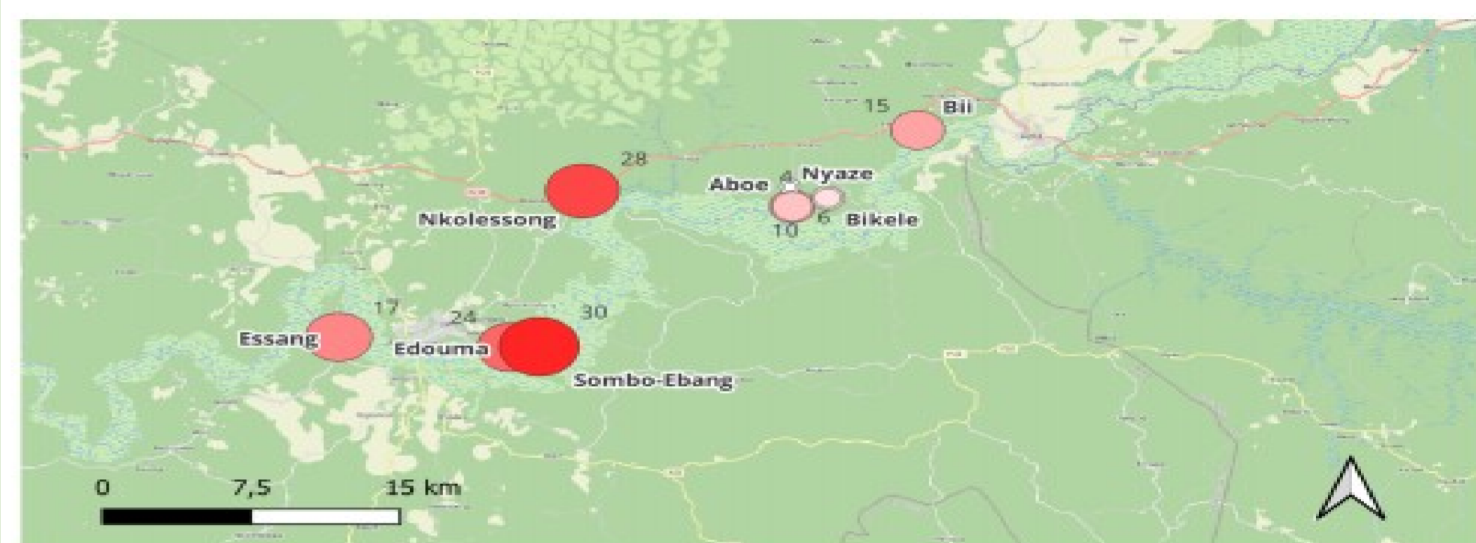
Figure 2: Number of households enrolled by village.