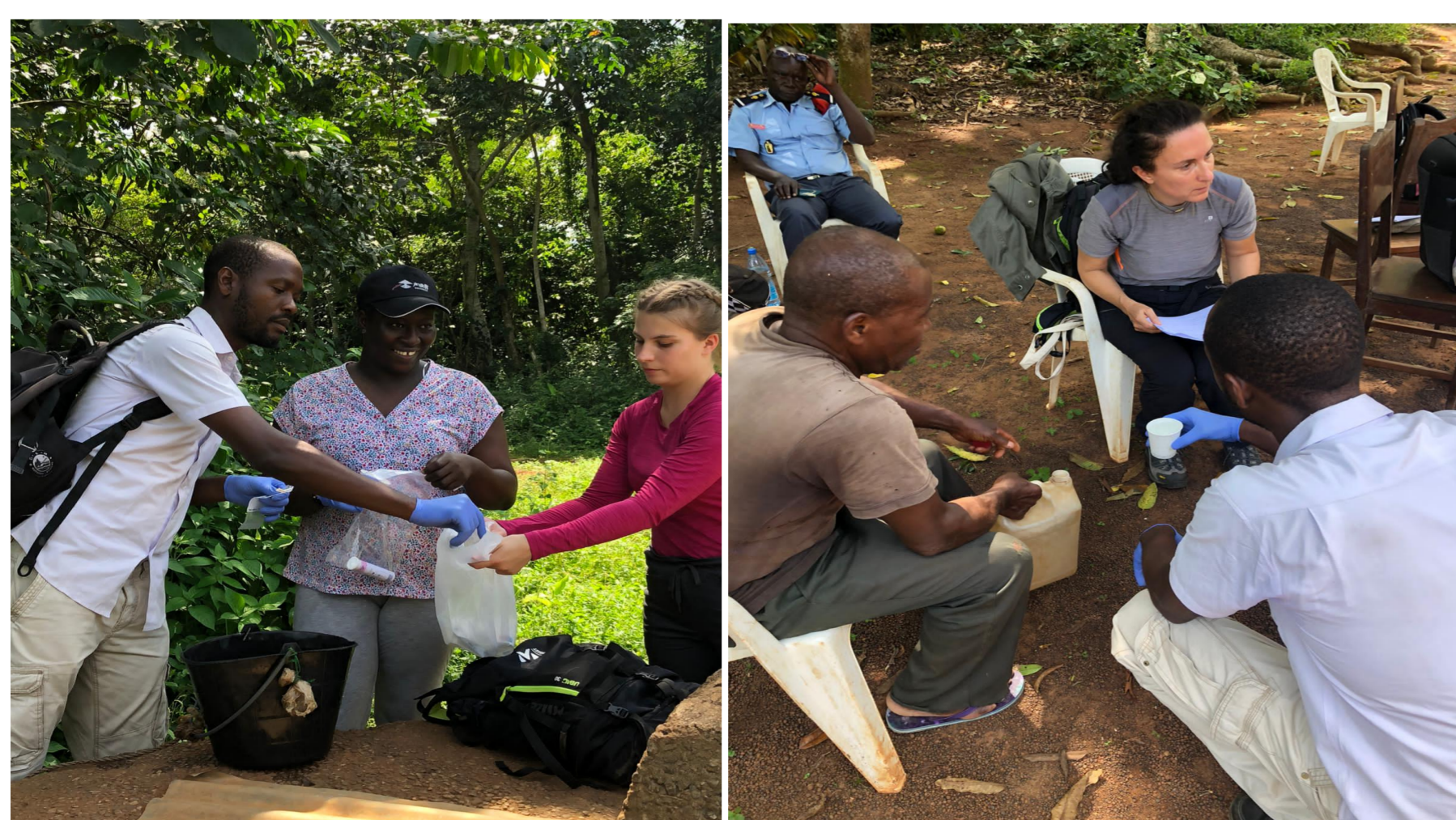
Figure 1: Illustration of the sampling of water supply points.