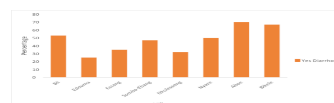
Figure 4: Proportion of episodes of diarrhoea for at least one member of the family in the last month by village.